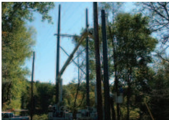
UNDER WAY: The new span goes up.

Warren Electric Cooperative (WEC) stepped into the future by using poles that are recycled fiber/resin, 70 feet in length and 5,000 pounds in weight, but telescopic for easier transportation, fewer highway permits and efficient installation. They are environmentally