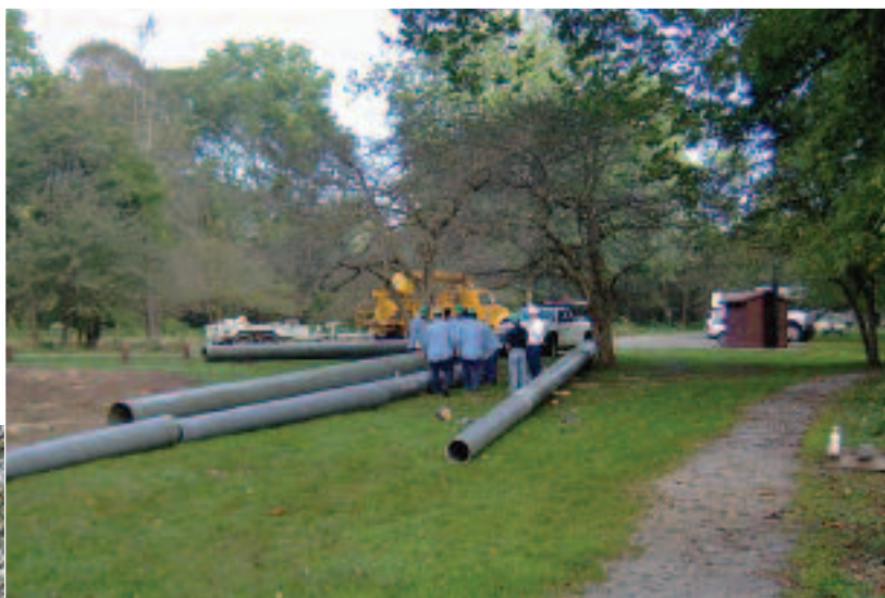
DO IT THIS WAY: On-site training and job briefings are conducted before work begins.