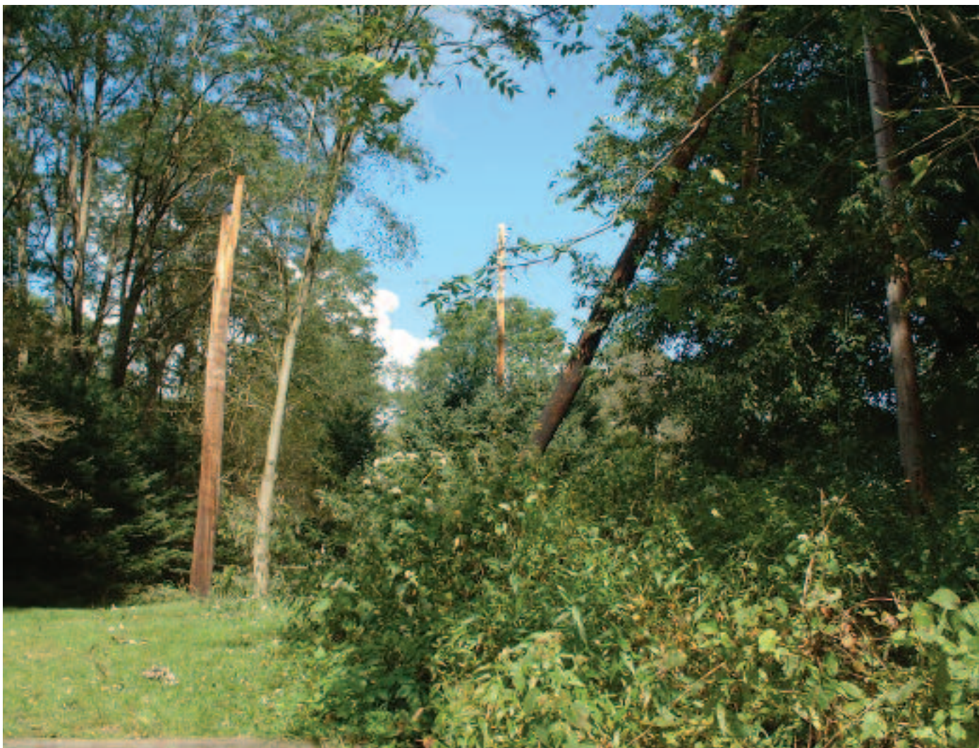
NATURE'S FURY: Remnants of wood structure show damage after the fall storm.