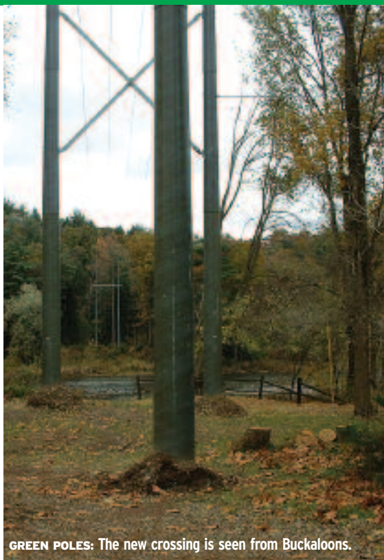
GREEN POLES: The new crossing is seen from Buckaloons.

Steel poles are lighter than concrete, but remain burdensome and are susceptible to environmental factors, like rust. Steel poles also can present a danger to people working on or near the poles. (Information from www.wipo.int )